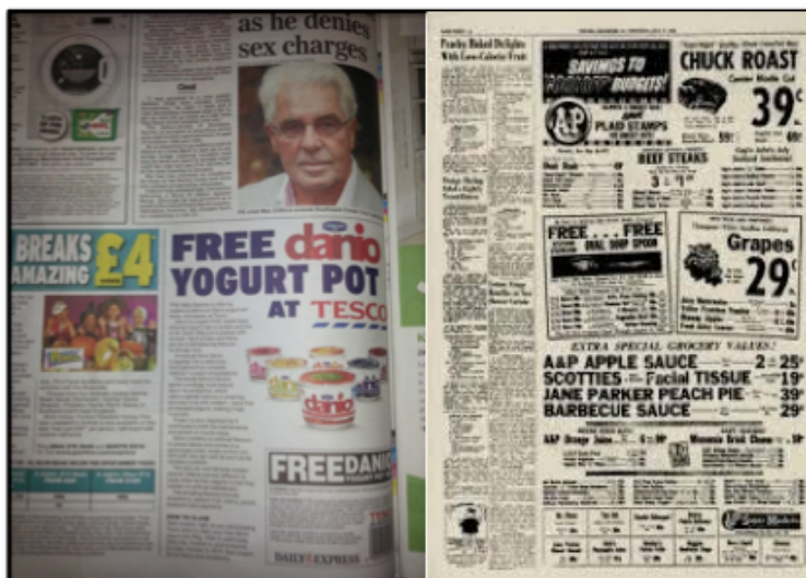
Figure 3 – Newspaper advertisement

The way in which store flyers are used and developed have changed over time. Since the insertion of promotional advertisements in newspapers (See Figure 3), they have evolved into mimeograph prints distributed for free in squares, parks, and high-traffic streets or through vehicles in the neighborhoods near the store (White et al., 1980). As new technologies evolved, new elaboration and distribution methods were created (Gázquez-Abad et al., 2014; Ziliani and Ieva, 2015). Currently, there is a wide range of ways to deliver store flyers to customers. Besides the old distribution methods (White et al., 1980), they are mailed to homes, personally delivered to customers, or distributed by other communication methods, such as the neighborhood or city newspapers (Gázquez-Abad et al., 2014; Mulhern and Leone, 1990; Pieters et al., 2007; White et al., 1980). Sending digital versions of store flyers via electronic mail directly to the target audience is also an increasing strategy of marketing departments (Gázquez-Abad et al., 2014). Another important characteristic of store flyers is their adaptability to different countries, regions, or cities (Reinartz et al., 2011; Shankar et al., 2011). It is also important to adopt strong local symbolism and signals adapted to local standards and culture (Arnold et al., 2001; Reinartz et al., 2011).