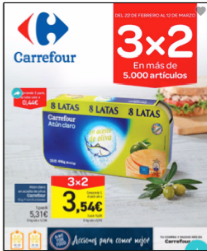
Figure 4 – Store brand product on the flyer cover page

equity (Ho-dac et al., 2013) and the strength of a brand is defined based on its recall and recognition (Romaniuk and Gaillard, 2007). In general, the strongest brands are often part of the choice set, are easier to remember, and attract more buyers than store brand products (Mimouni Chaabane et al., 2010).