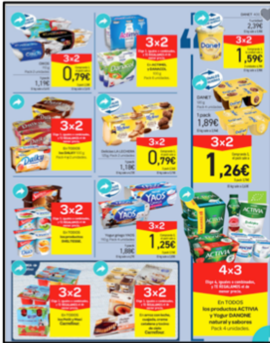
Figure 6 – Inside page

retailer has a varied assortment (Mimouni Chaabane et al., 2010). Even if the total size of the assortment remains unchanged, the presence of national brands can improve the flow of visitors in the store (Oppewal and Koelemeijer, 2005).