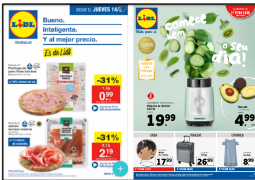
Figure 5 – Slogan on the flyer cover page

Store flyers of the most prestigious leading chains in Spain usually display a slogan along with the brand on the cover page. For example, a flyer of the Corte Inglés brings the slogan "get used to our good prices," Aldi displays the slogan "what is worth a lot costs very little" (Example of the slogan used by Lidl in Figure 5). However, the role played by the slogan on the cover of store flyers is not well understood.