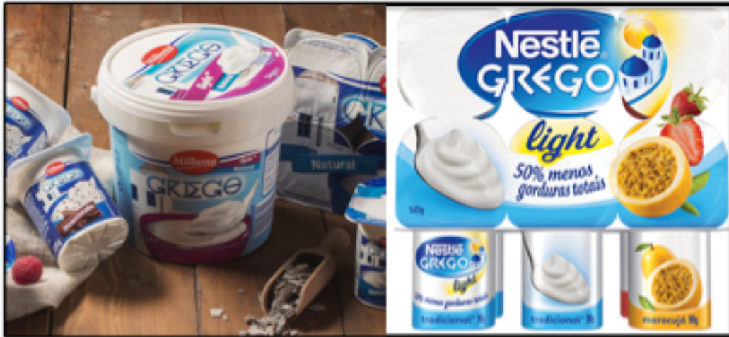
Figure 2 – Example of a store (Milbona) and a national (Nestlé) brand product

From a marketing perspective, the difference between retailer and manufacturer brands lies in the characteristics used for their advertisement, the method or channel used for distribution, and the pricing policy (Ailawadi et al., 2009).